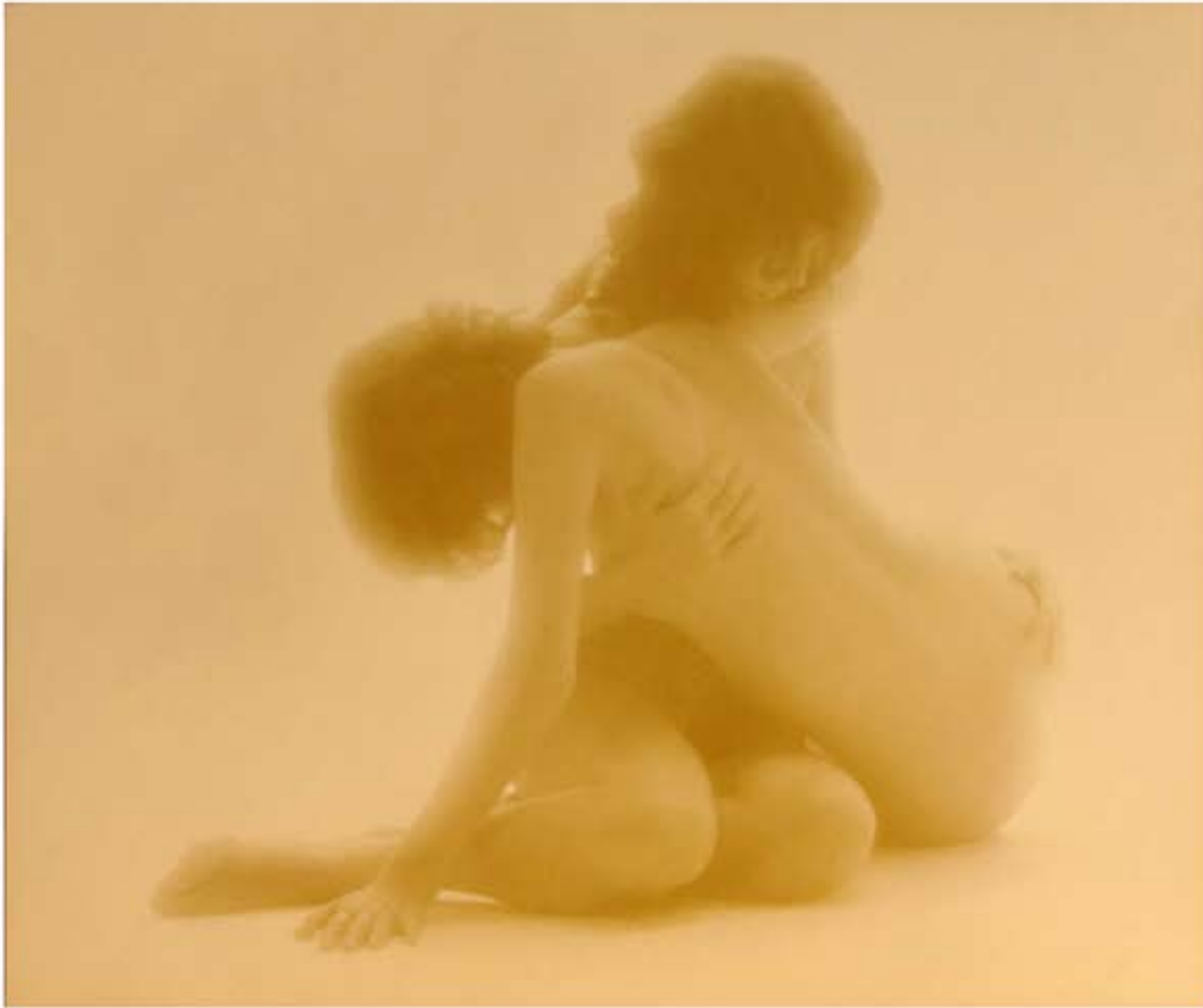
Mood Indigo / #4 Individual Works Collection