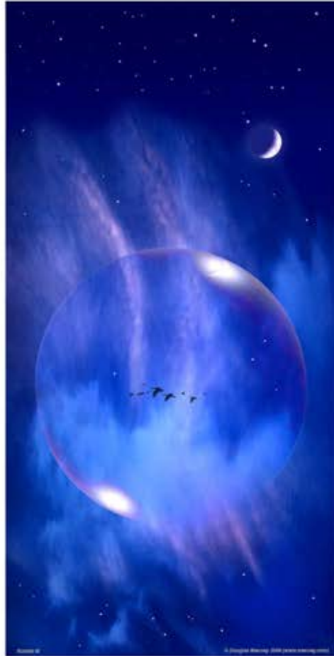
Bubble Individual Works Collection