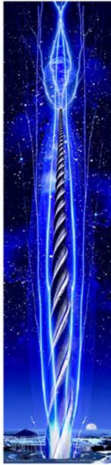
Giving and Receiving / #2 Individual Works Collection