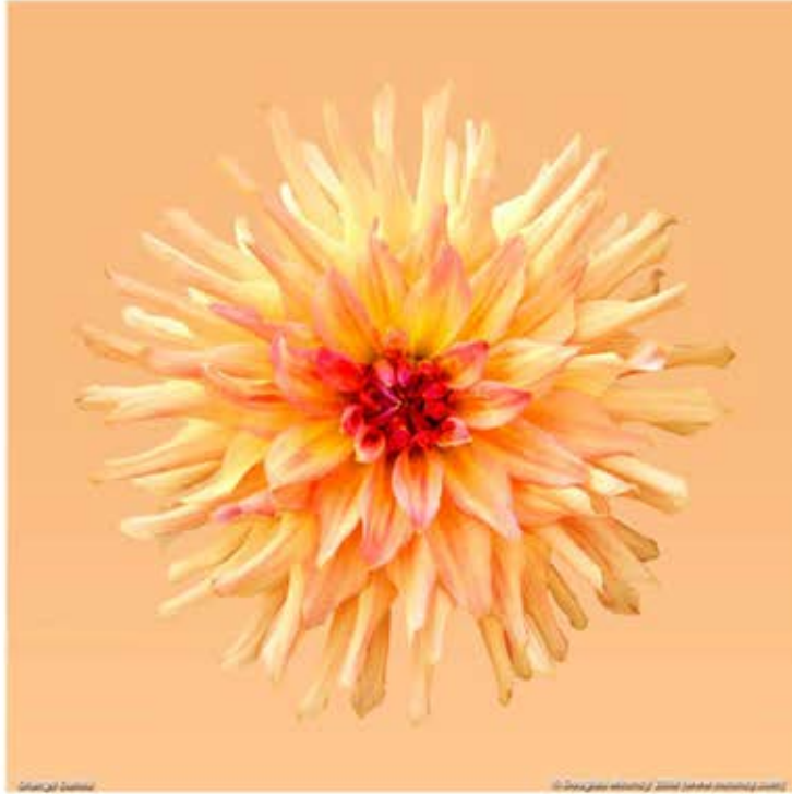
Dahlia Duet / Orange Dahlia Individual Works Collection