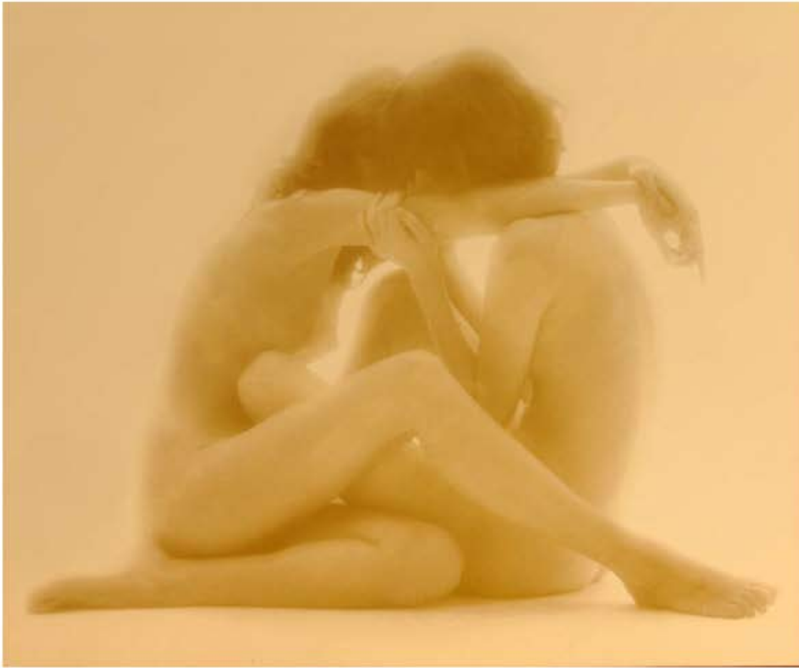
Mood Indigo / #3 Individual Works Collection