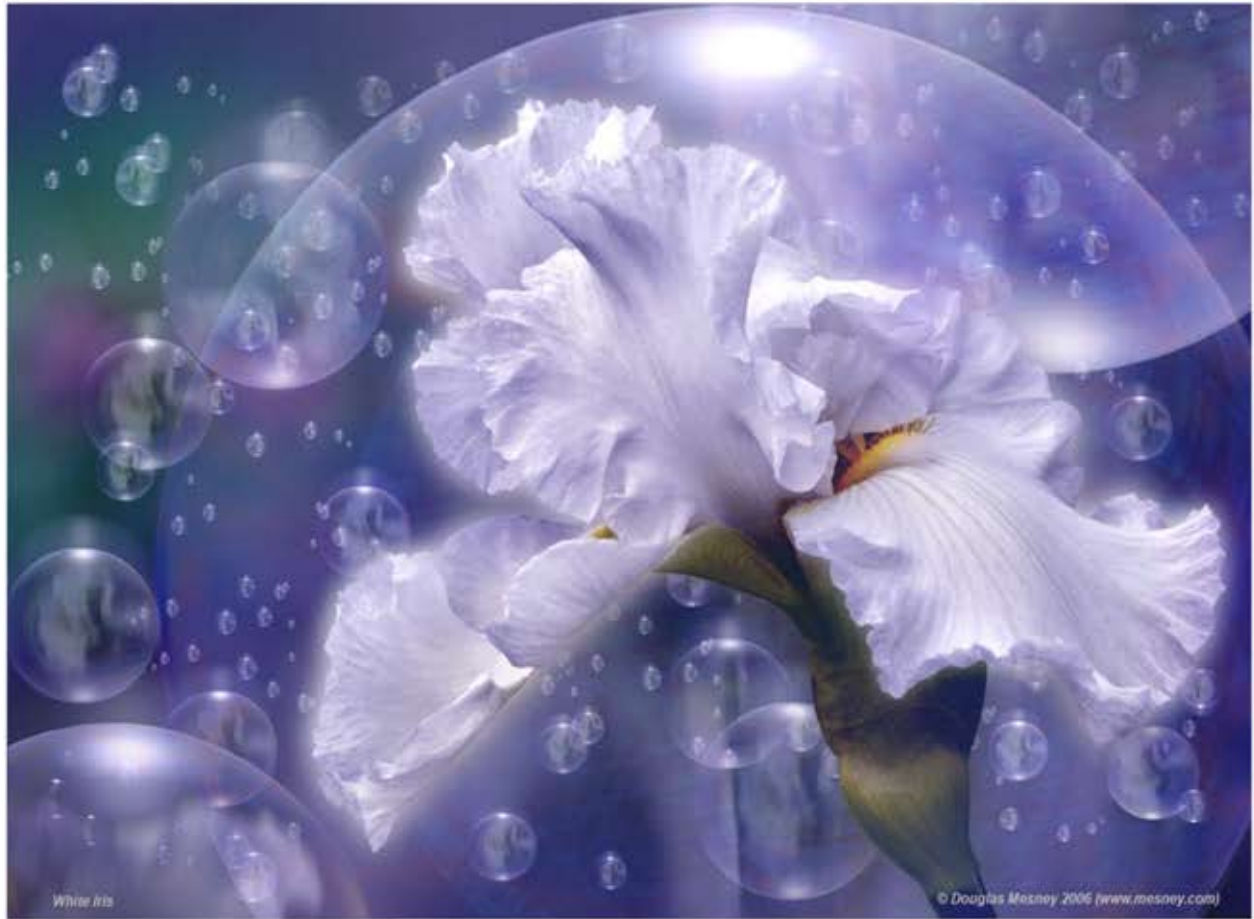
White Iris Individual Works Collection