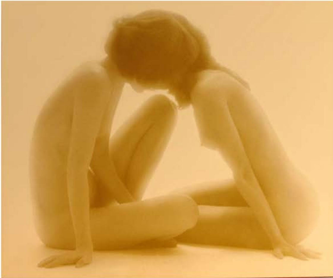
Mood Indigo / #2 Individual Works Collection